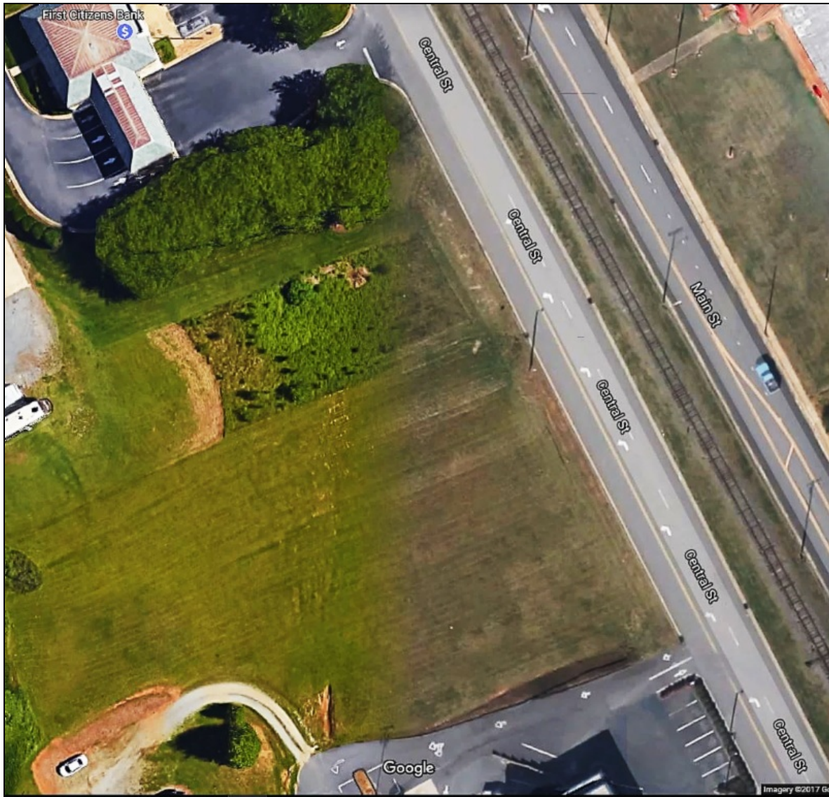
Worn down grassy areas indicate heavy pedestrian use along Central Street downtown between the pharmacy and bank.

encourage municipalities to develop comprehensive bicycle and pedestrian plans. When implemented, these plans will lead to the creation of more walkable and bikeable communities.