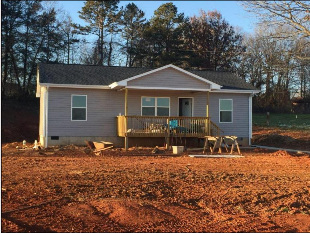
Construction of Alexander Habitat for Humanity Home, Cooksey Court Taylorsville.

Alexander County Habitat for Humanity in November was the latest to receive Community Housing Development Organization (CHDO) funds in the amount of $29,505 from the Unifour Consortium HOME Program. These funds are being used for the construction of a Habitat home located on Cooksey Court in Taylorsville. This new three bedroom home is being sold to a qualifying Habitat for Humanity applicant. Community Housing Development Organizations (CHDOs) are non-profit organizations doing housing-related activities which benefit low-income families. The Unifour Consortium HOME Program budgets 15% of its annual funding to assist local Community Housing Development Organizations (CHDOs).