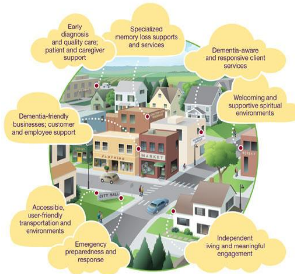
Figure 3.2: ACT on Alzheimer’s Dementia-Friendly Community Resources 25